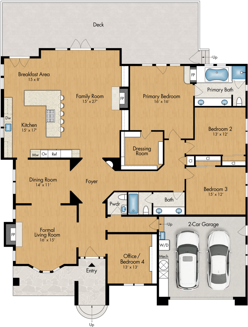
Main Level 3,090 SQ FT Plus Garage: 522 SQ FT

Calculated per ANSI Standard Z765-2003 Estimated Total Finished and Unfinished Square Footage: 3,612 SQ FT